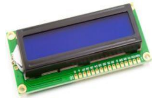
Figure 5: LCD III RESULTS AND DISCUSSION

Liquid crystal display is used to show the information about the robot. SIZE- 16 X 2 (16 COLUMNS AND 2 ROWS)