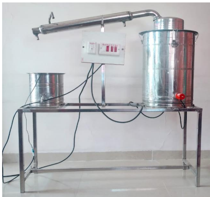
Figure No: 2, Actual Model of Extraction Unit

, which is then connected with steel pipe which goes through one end of condenser which is used for cooling the formed steam and then from other end of condenser the water droplet receiving pipe is connected from which cooled water droplet is goes and collected in collecting drum. The thermostat is also used for measurement of rising temperature of boiling unit And cooling water unit is separated connected at bottom side which supplies continuously cooled water to condenser for cooling the steam. This unit is connected to condenser from two point, one is input and other is output. From input point the cooled water is supplied to condenser to cool down the steam and from output point the heated water is collect out in cooling Drum, then this heated water is again get cooled in cooling drum and it again supply to condenser, this process is happen continuously. The separating funnel is used for the separation of essential oil and extract water.