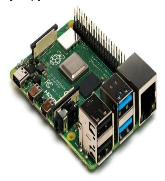
Figure.1 Raspberry pi