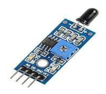
Figure.3 Flame sensor

Flame sensor is used to detect occurance of fire. This sensor is most sensitive to normal light hence known as flame sensor. This sensor detects fire in the range of 760nm to 1100nm. the output of sensor is digital. This sensor is used in robot like alarm. This sensor is easy to use and also it has very fast response time.