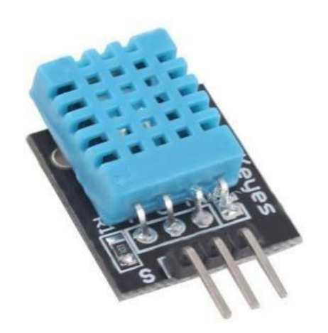
Figure. 2 DHT11

DHT11 is a low cost digital temperature sensor. It uses thermistor to monitor quality of air and covert it to digital signal. The digital signal is send by data pin. It is simple to use and requires careful handling. It requires 4.7k or 10k resistor to pull up from data pin to VCC.