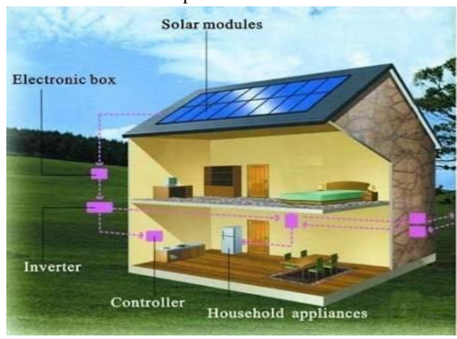
Figure 3 Solar electricity can be generated directly using photovoltaic (PV) panels.

By using the photons of light from the sun panels excite electrons in silicon cells thus converting sun ray into electricity. The south facing installation of solar panels will provide the optimum potential for our system, rather than the other orientation. The panel should receive sunlight during the prime sunlight hours from 9 am to 3 pm, so that it will provide sufficient production and make sure that panels doesn't come under the shade. If one cell out of the 36 cells is under shade then it can reduce the power production may more than half. There are some devices such as solar pathfinder which carefully identifies the area under shade before the installation of panels.