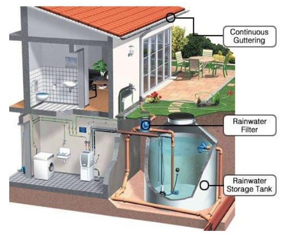
Figure 2 Rooftop rain water harvesting

mesh filtered at mouth and first flush device followed by filtration system. It is one of the cost effective way of rainwater harvesting in which the stored water can be used for secondary purposes such as gardening and washing.