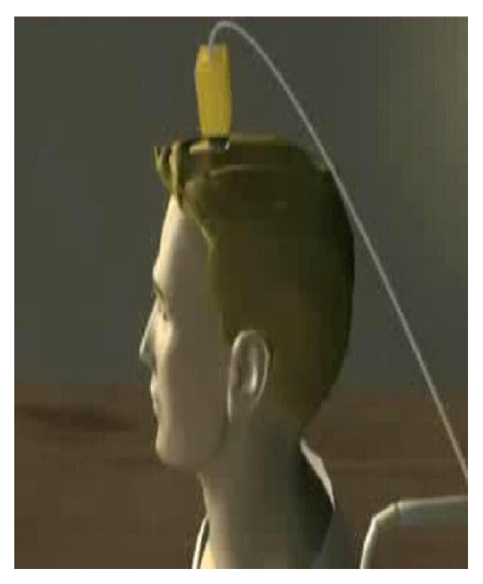
Figure 5 Connector

|| Volume 3 || Issue 10 || October 2018 || ISSN (Online) 2456-0774 INTERNATIONAL JOURNAL OF ADVANCE SCIENTIFIC RESEARCH