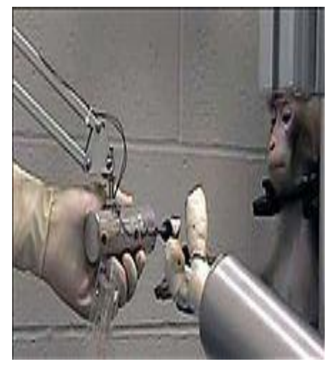
Figure No. 2 Experiment on Monkey by BCI

Several laboratories have managed to record signals from monkey and rat cerebral cortices to operate BCIs to produce movement. Monkeys have navigated computer cursors on screen and commanded robotic arms to perform simple tasks simply by thinking about the task and seeing the visual feedback, but without any motor output.In May 2008 photographs that showed a monkey at the University of Pittsburgh Medical Center operating a robotic arm by thinking were published in a number of well-known science journals and magazines.Other research on cats has decoded their neural visual signals.