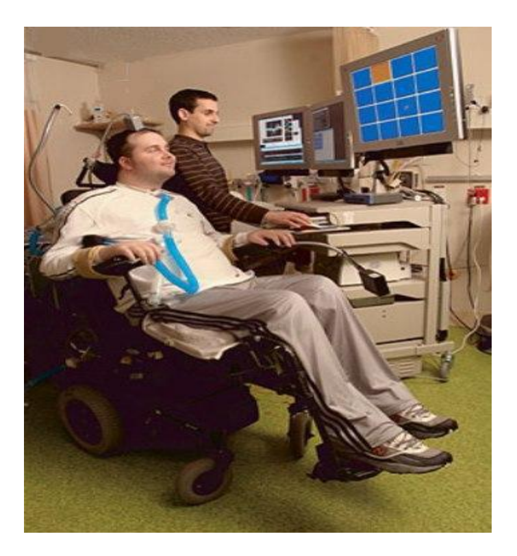
Figure 3 Clinical Trial V COMPONENTS USED BY BCI:

More recently, research teams led by the Braingate group at Brown University and a group led by University of Pittsburgh Medical Center, both in collaborations with the United States Department of Veterans Affairs, have demonstrated further success in direct control of robotic prosthetic limbs with many degrees of freedom using direct connections to arrays of neurons in the motor cortex of patients with tetraplegia.