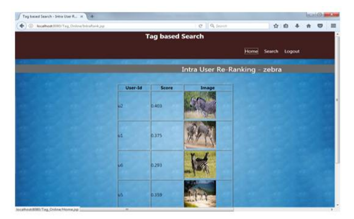
3 Image User Re-ranking Zebra