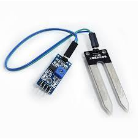
Figure 4: Moisture Sensor