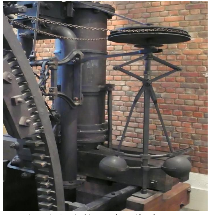
Figure 1 Historical image of centrifugal governor

Boulton & Watt engine of 1788 James Watt designed his first governor in 1788 following a suggestion from his business partner Matthew Boulton. It was a conical pendulum governor and one of the final series of innovations Watt had employed for steam engines. James Watt never claimed the centrifugal governor to be an invention of his own. Centrifugal governors were invented by Christian Huygens and used to regulate the distance and pressure between millstones in windmills in the 17th century.