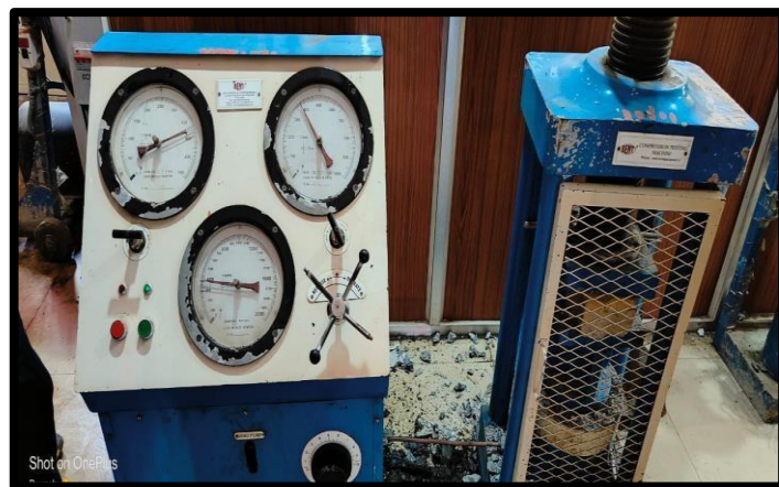
Fig2. Paving block Testing