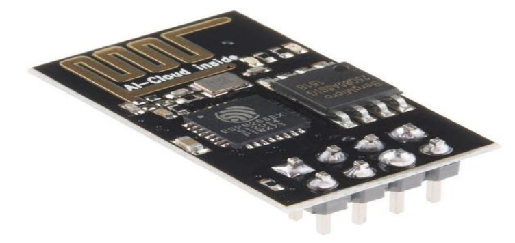
Fig-2: ESP8266 WIFI Module

ESP8266 is a WIFI module which has integrated TCP/IP protocol which gives the access to the microcontroller to the WIFI network. It is pre-programmed with an AT command set firmware. It is mostly used for the development of IOT embedded applications.