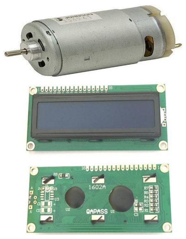
Fig-: 16x2 LCD Display

It is an electronic display module and has a wide range of applications. It can display 16 characters per line and it has 2 such lines. The 16x2 LCD is capable of displaying 224 different characters and symbols. Here the LCD display is used to show whether the payment is done successfully or not.