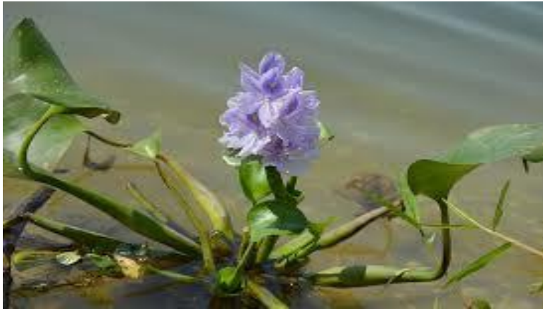
Figure 1 Water hyacinth

information system (GIS) application that supports viewing, editing, and analysis of geospatial data.