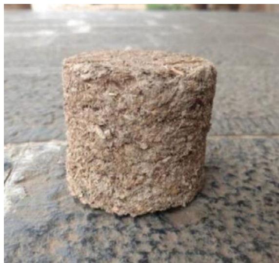
Figure 5 Briquette

A briquette is a compressed block of coal dust or other combustible biomass material (e.g. charcoal, sawdust, wood chips, peat, or paper) used for fuel and kindling to start a fire. The term derives from the French word brique , meaning brick. In order to facilitate easy handling of the water hyacinth briquettes of suitable dimensions can be made.