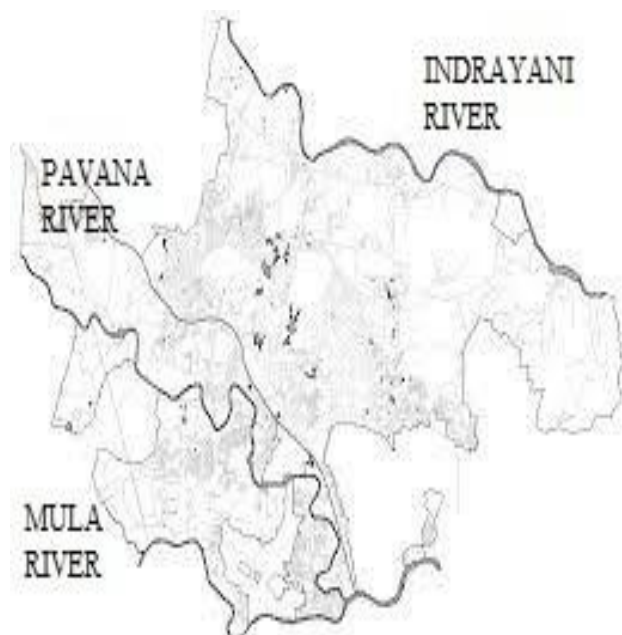
Figure 3 Rivers in PCMC

Streams in consideration as per PCMC 2019 TENDER: