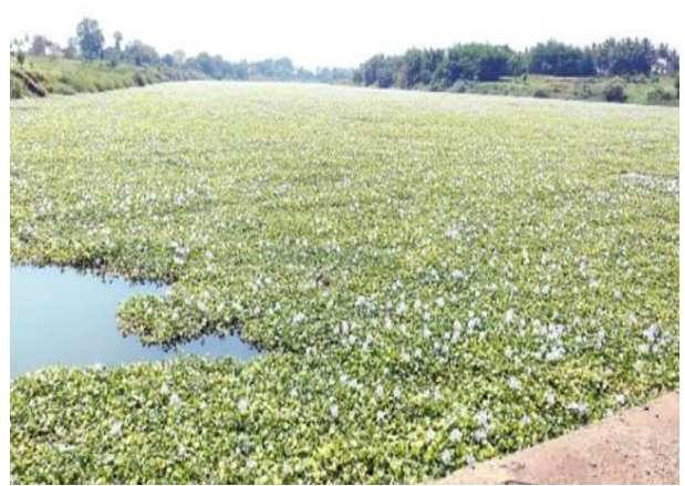
Figure 2 Typical water hyacinth species in Pune River

QGIS functions as geographic information system (GIS) software, allowing users to analyze and edit spatial information, in addition to composing and exporting graphical maps.[3] QGIS supports both raster and vector layers; vector data is stored as either point, line, or polygon features. Multiple formats of raster images are supported, and the software can georeference images.