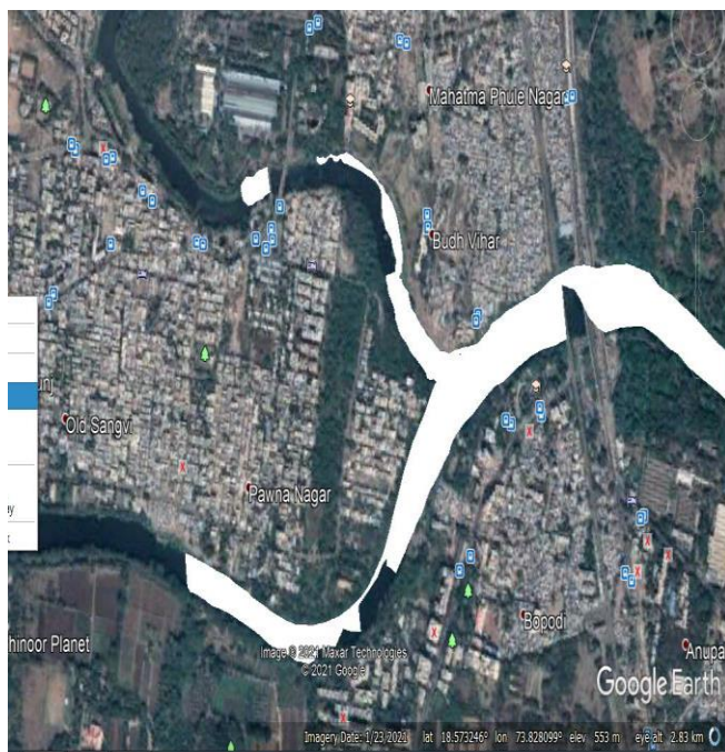
Figure 4 Mapping water hyacinth