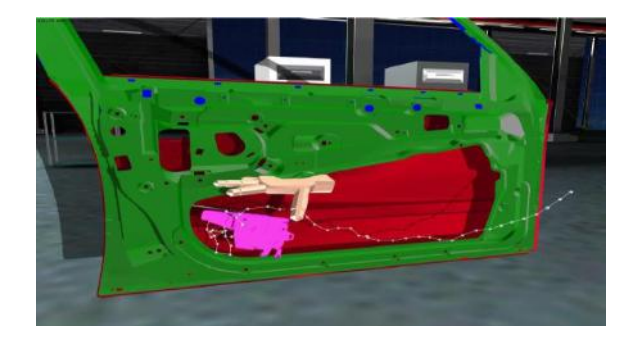
Figure 3(b): Product Assembly

manufacturing processes, as well as product and process development, leading to shorter lead-time, reduced cost and improved quality [4]. The ultimate goal is to create a system that is as good as the real world, if not better and more efficient.