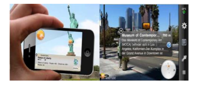
Figure 3(c): Navigation in urban environments.

Results clearly show that the use of augmented displays result in a significant decrease in navigation errors and issues related to divided attention when compared to using regular displays. Nokias MARA project31 researches deployment of AR on current mobile phone technology.