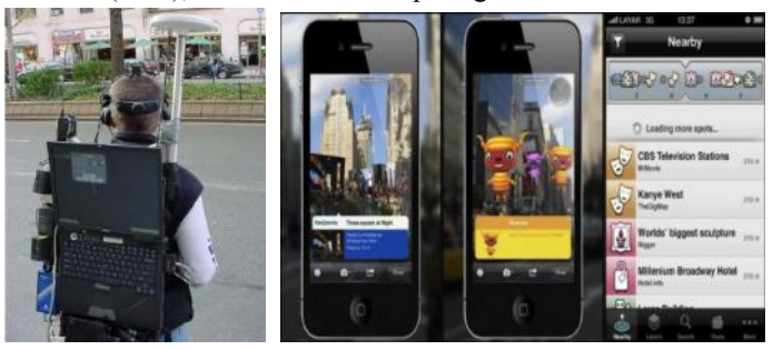
Figure 2: Mobile AR: (a) user with Mobile AR system backpack; (b) example of AR application that uses mobile devices.

Computer-presented material is directly integrated with the real world surrounding the freely roaming person, who can interact with it to display related information, to pose and resolve queries, and to collaborate with other people. The world becomes the user interface [10]. Hence, mobile AR relies on AR principles in truly mobile settings; that is, away from the carefully conditioned environments of research laboratories and special-purpose work areas. Quite a few technologies must be combined to make this possible: global tracking technologies, wireless communication, location-based computing (LBC) and services (LBS), and wearable computing.