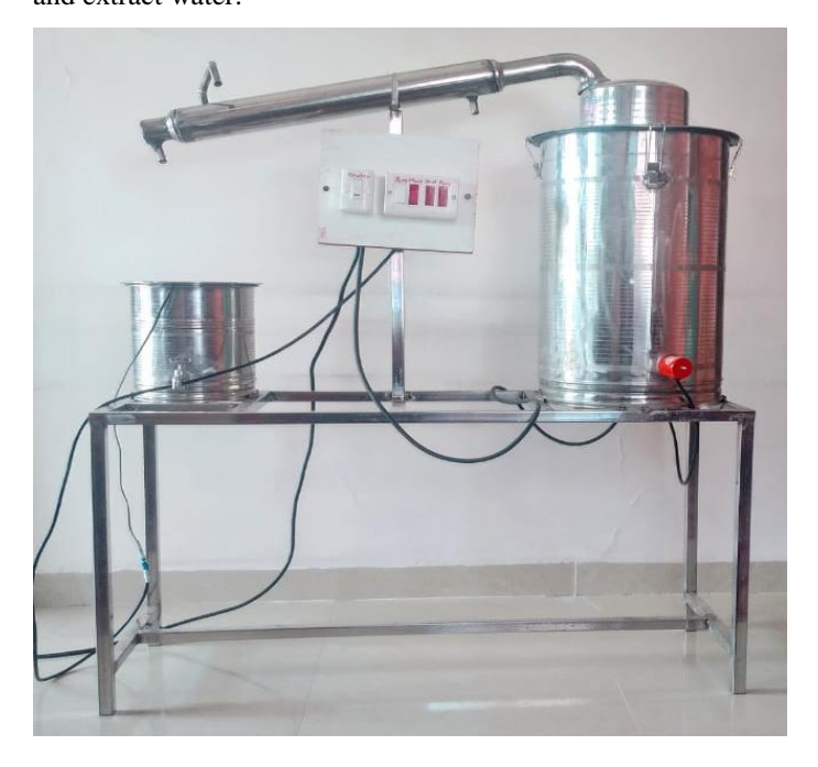
Figure No: 2, Actual Model of Extraction Unit

, which is then connected with steel pipe which goes through one end of condenser which is used for cooling the formed steam and then from other end of condenser the water droplet receiving pipe is connected from which cooled water droplet is goes and collected in collecting drum. The thermostat is also used for measurement of rising temperature of boiling unit And cooling water unit is separated connected at bottom side which supplies continuously cooled water to condenser for cooling the steam. This unit is connected to condenser from two point, one is input and other is output. From input point the cooled water is supplied to condenser to cool down the steam and from output point the heated water is collect out in cooling Drum, then this heated water is again get cooled in cooing drum and it again supply to condenser, this process is happen continuously. The separating funnel is used for the separation of essential oil and extract water.