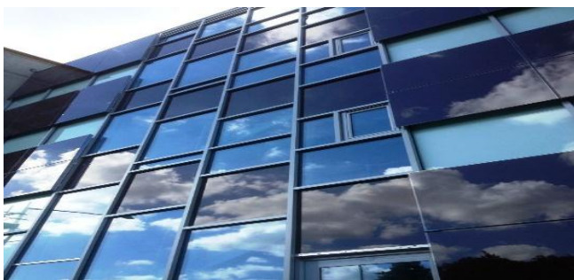
Figure 1 PV Glazing

Photovoltaic glass (PV glass) is a technology that enables the conversion of light into electricity.