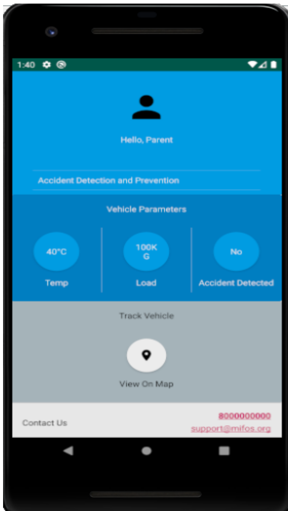
Figure 2: Parent Page