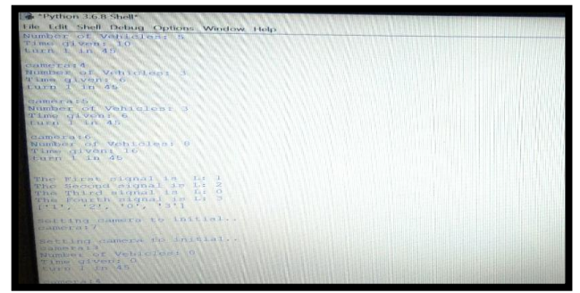
Figure 6: Result 3

Result 2 –Number of vehicles present in captured image is get detected by using image processing technique and required dynamic time is get calculated (2s for 1 vehicle as shown in fig 5).