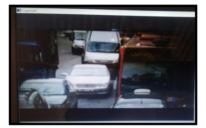
Figure 4: Result 1 - Capture image of each road in Chowk to detect/count vehicle's present on the road by rotating camera in 90degrees with the help of servo motor.