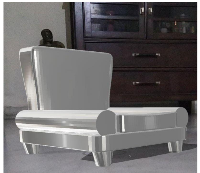
Figure 1: Rendered 3D model

Vertical Plane recognition along with horizontal Plane recognition is a challenge. Implementing both of the aspects alter- natively in the system as separate features will allow user to specifically perform visualization of various features of interior design separately and depict a clean implementation. Features like placing furniture, changing wall paints, visualization various interior design plans, patterns, ceiling designs, light lamps and so on will help user enhance their understanding and design of their home structure.