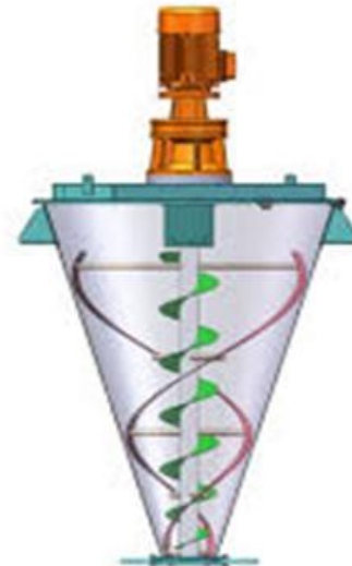
Figure 5 Working principle of conical agitator

The mixing process can be optimized by controlling the mixing energy, which can be achieved by adjusting the rotational speed. The conical paddle mixer has a typical rotor speed of between 1 and 10 m/s.