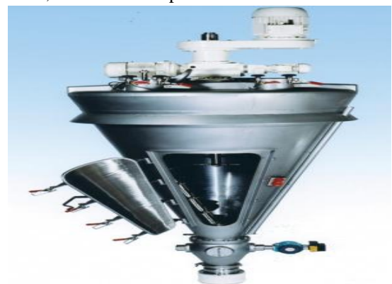
Figure 1 Conical Agitator

Agitation plays an essential role in the success of many chemical processes, and there is a wide range of commercially available impellers that can provide the optimum degree of agitation for any process. The problem arises in selecting the best impeller for the required process. Equipment manufacturers often provide expert guidance, but it is beneficial for designers and engineers to acquire fundamental knowledge of various types of impellers. These objectives, summarized in physical properties such as viscosity play an important role in the selection of impellers in laminar, transitional, and turbulent operations.