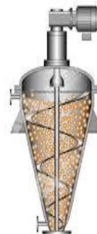
Figure 3 Conical curve agitators (Internal container)