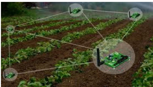
Figure 1: Drip Irrigation System using WSN

If the greenhouse vegetation is high and dense, the small and light weight nodes can be hanged up with the branches. WSN is easy to maintain, relatively inexpensive and trouble-free. The only other expense occur only when the sensor nodes run out of batteries and the batteries have to be charged or replaced. Lifespan of the battery can be increased to several years if a proficient power saving algorithm is applied. In this work, the very first steps towards the wireless greenhouse automation system by building a wireless measuring arrangement for that purpose is taken and by testing its feasibility and reliability with a straightforward setup [2, 3].